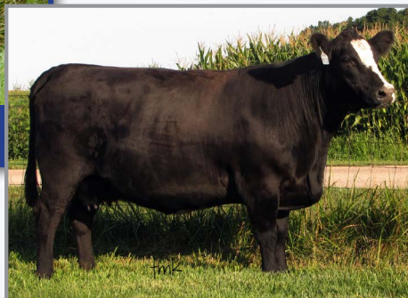
Dam of Lot 14

It's halfbloods like this Revival daughter that have made the percentage Simmentals so hot in the cattle business! It would be hard to build one much better from the ground up. She is easy moving, great in her lines, and smooth and extended in her front third. Her mother is a Chain Reaction daughter that goes back to EXT and 6807 on the bottom side. You can see from the picture she is the true definition of a ground pounder. If you're looking to compete in the halfblood division next year, pay attention here! She will sell with Simmental registration papers.