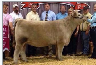
Full Sib to mating 4th Overall - Ohio State Fair Shown by: Gilbert Family