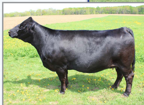
TRU Iva Mae 2302 Grand Dam of Lot 12

ALST Iva Mae 751E is a great 3/4 Simmental show heifer prospect. She has been a standout from day one. Her dam is a first calf heifer that calved unassisted and we are excited about her future production. Our boys have decided to focus on showing our purebred Angus cattle so we can sell the top of our Simmental heifers to you.