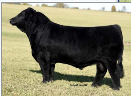
FBF1 Absolute Sire to Lots 31 & 32

Selling choice of 3 or 5 IVF sexed heifer embryos, guarantee 1 pregnancy (3 embryos) or 2 pregnancies (5 embryos) if done by certified embryologist. A family line that has stood the test of time. Babe is the stoutest made female of the Fantasy cow line we have ever seen. This Built Right daughter is simply a powerhouse that adds bone, foot shape and lots of internal dimension into her progeny. Since acquiring this elite donor female from C&C Farms we have put her right to work in the donor pen creating matings on the top bulls in the breed. Absolute set the world on fire in 2015 by winning World Beef Expo where he sold for $20,000 for half interest! He went on to Louisville and Denver respectively winning his division. This mating has purple in the future!