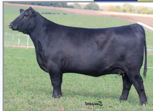
PVF Blackbird 3187 Dam to Lot 25

With Jr. Nationals being in Madison, WI this year, this heifer would be a perfect project for any Junior. She has the look and body shape to perform at a high level show. Her dam, 3187, hasn't missed on a calf yet. She reminds us of her mother and will be profitable long after her show career is over.