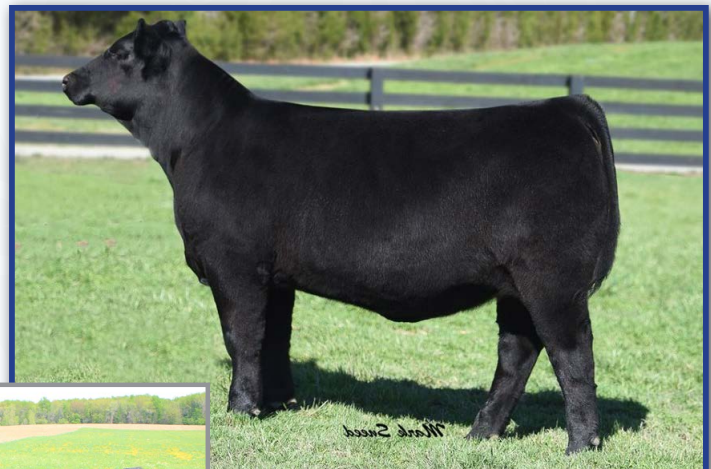
TRU Iva Mae 5451 Dam of Lot 12