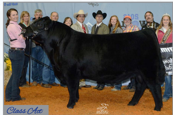
2016 Supreme Champion Bull World Beef Expo

This is the first daughter of Class Act born on our farm, and if this is what his daughters are going to look like, we are excited! Cassie is a true example of our motto, "Our females make the difference." She has everything we love in a female; she's long sided, big middled, feminine fronted, elegant in her lines, and soft and easy moving when you put her in motion. Her mother has been a very good producer for us with this being her fourth heifer calf; three are producing in our herd, and we are offering this one for sale to you! Cassie's father won the Wisconsin State Fair, Iowa State Fair, and was selected Supreme Champion Bull at the World Beef Expo. Class Act was declared by many as a true maternal breeding bull on display in the yards at Denver. His semen is now available through Cattle Visions. With a mother and father like Cassie has, she has a very bright future ahead of her both in the show ring and as a future donor cow in production. She will sell with Chianina registration papers.