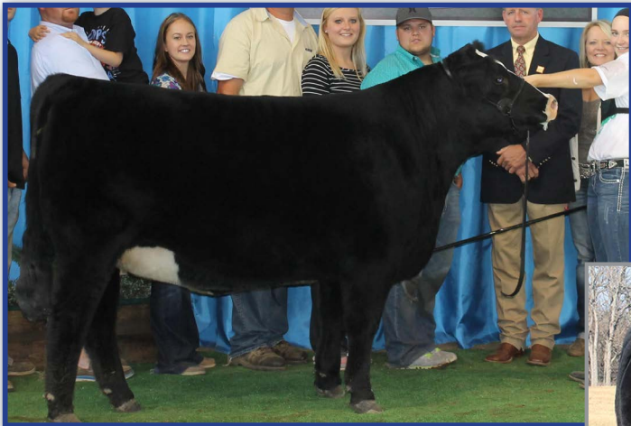
American Girl Dam of Lot 33