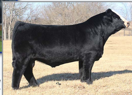
TKCC Classified Sire of Lot 33

Mr TR Hammer 308A ET TKCC Classified Ford RJ Dolly Y83 Mr HOC Broker American Girl Miss America