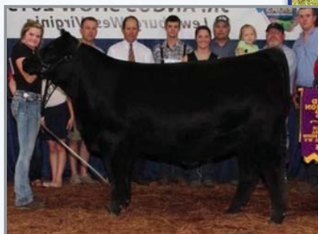
PVF Proven Queen 4075 Dam of Lot 26

7030 is out of our powerful donor, PVF Proven Queen 4075, who won the 2015 Eastern Regional Jr. Angus Show. She has her mothers power and mass, with look and style. This heifer has so much potential in the show ring, then will go home and make the transition to the donor pen seamlessly just like her mama.